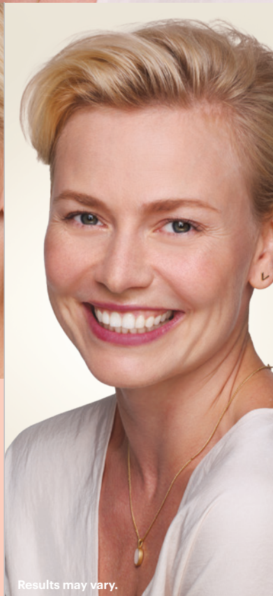
Results may vary.

JUVÉDERM® Injectable Gel Fillers Important Information (continued) IMPORTANT SAFETY INFORMATION (continued) What precautions should my doctor advise me about? (continued)