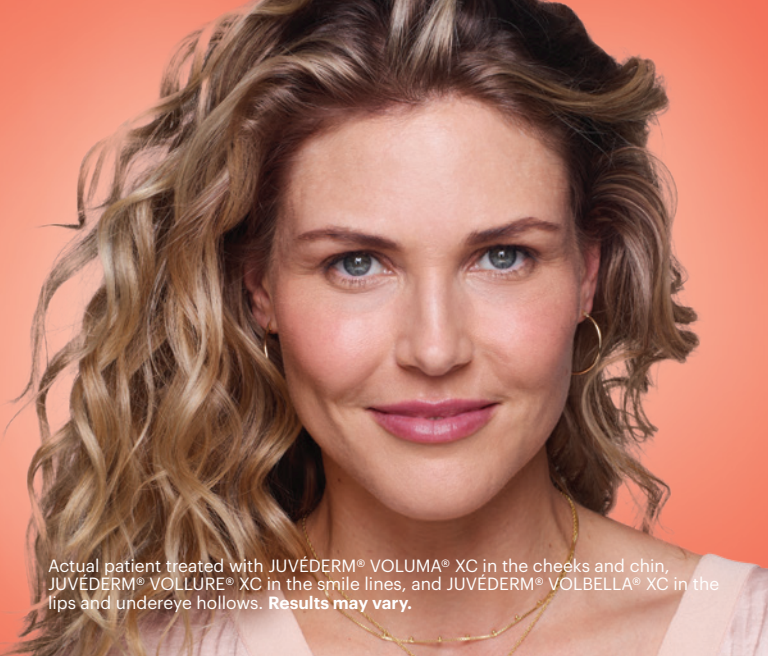
Actual patient treated with JUVÉDERM® VOLUMA® XC in the cheeks and chin, JUVÉDERM® VOLLURE® XC in the smile lines, and JUVÉDERM® VOLBELLA® XC in the lips and undereye hollows. Results may vary.

“I got the subtle, smooth, natural-looking results I wanted—JUVÉDERM® made all the difference.”