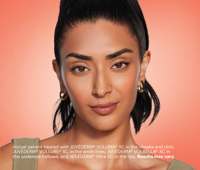
Actual patient treated with JUVÉDERM® VOLUMA® XC in the cheeks and chin, JUVÉDERM® VOLLURE® XC in the smile lines, JUVÉDERM® VOLBELLA® XC in the undereye hollows, and JUVÉDERM® Ultra XC in the lips. Results may vary.

"I can't believe the difference it made to add some volume to my cheeks and plump to my lips."