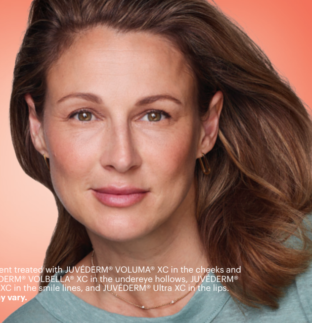
Actual patient treated with JUVÉDERM® VOLUMA® XC in the cheeks and chin, JUVÉDERM® VOLBELLA® XC in the undereye hollows, JUVÉDERM® VOLLURE® XC in the smile lines, and JUVÉDERM® Ultra XC in the lips. Results may vary.

"Smooth, less tired-looking* undereyes is exactly what I was going for—nothing is overdone."