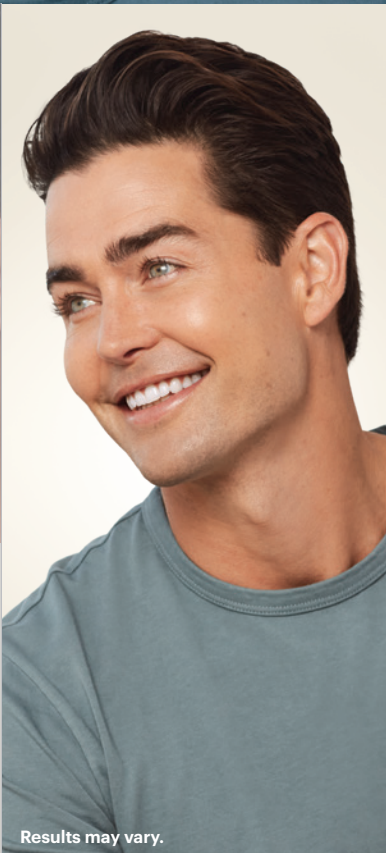
Results may vary.

After treating additional areas • 1.0 mL of JUVÉDERM® VOLBELLA® XC in the undereye hollows • 3.6 mL of JUVÉDERM® VOLUX® XC in the jawline Total: 8.9 mL