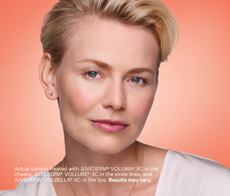
Actual patient treated with JUVÉDERM® VOLUMA® XC in the cheeks, JUVÉDERM® VOLLURE® XC in the smile lines, and JUVÉDERM® VOLBELLA® XC in the lips. Results may vary.

"Tasteful and classic, I look like me—with a more youthful appearance and a subtle boost to my lips."