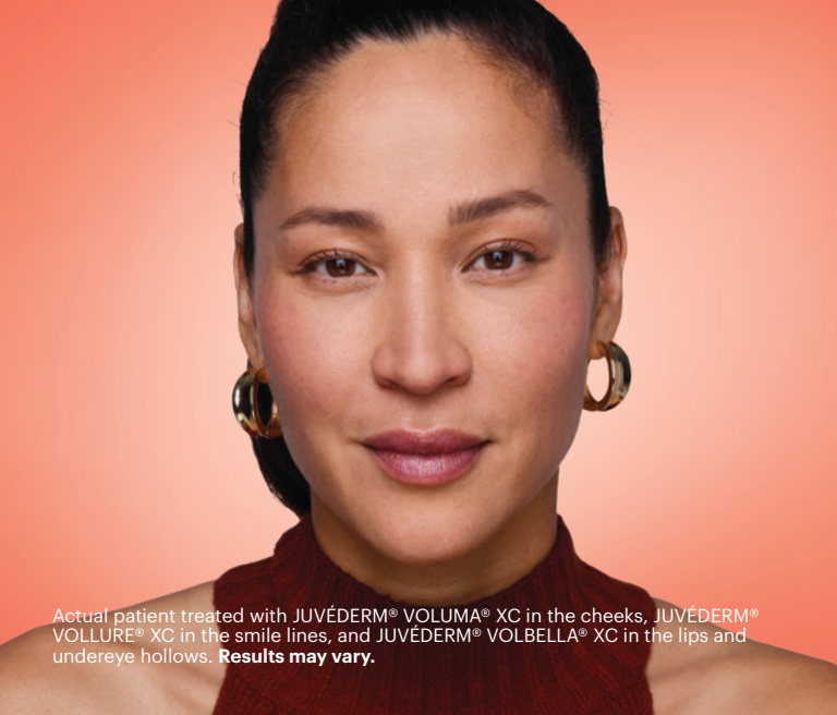
Actual patient treated with JUVÉDERM® VOLUMA® XC in the cheeks, JUVÉDERM® VOLLURE® XC in the smile lines, and JUVÉDERM® VOLBELLA® XC in the lips and undereye hollows. Results may vary.

“I got the look that I wanted—natural and subtle.”