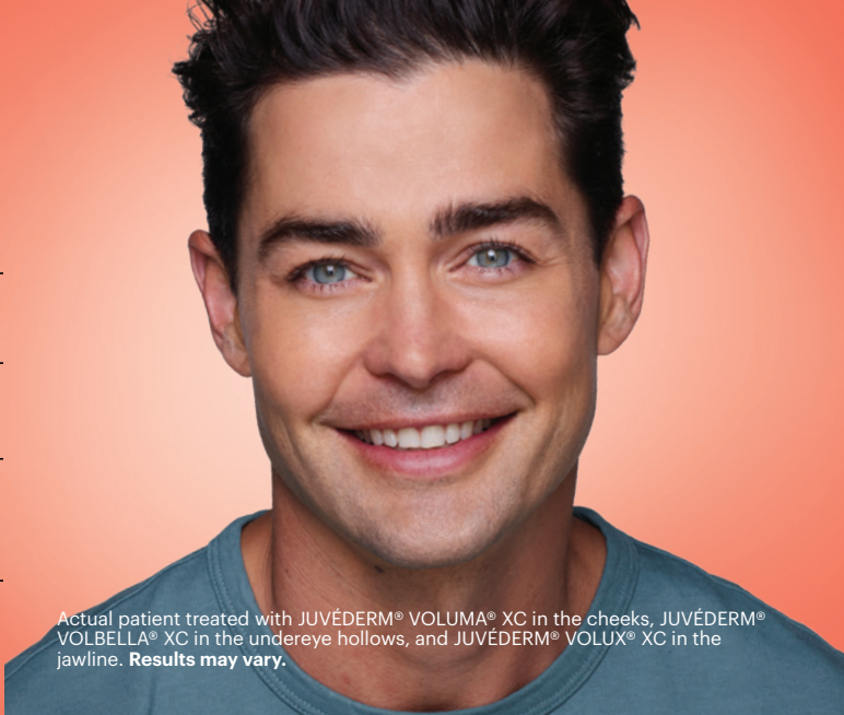
Actual patient treated with JUVÉDERM® VOLUMA® XC in the cheeks, JUVÉDERM® VOLBELLA® XC in the undereye hollows, and JUVÉDERM® VOLUX® XC in the jawline. Results may vary.

“I am so happy with the subtle results in my undereye area and jawline—and that they’re long-lasting!”